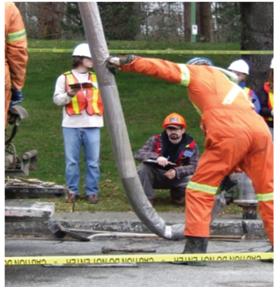
A SAMPLE BEING EXTRUDED INTO PLASTIC CORE BAG